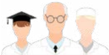
Education and further training