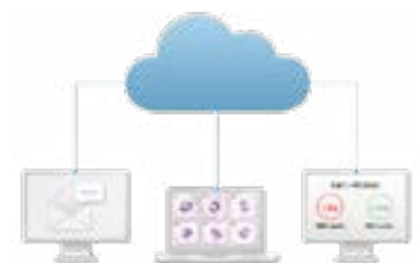
Remote access to test results