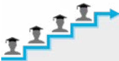
Proficiency level supervision